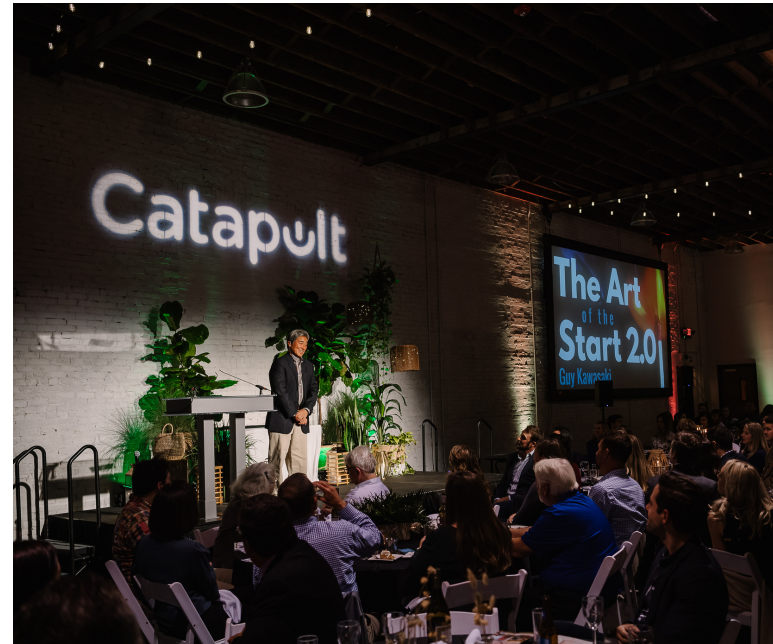
Table sponsorship includes six seats for representatives from your company as well as spouses/significant others. The remaining 4 seats will be given to Catapult entrepreneurs as a way for your company to get to know them, their business, and how Catapult is serving them.

Catapult hosts an annual fundraising event to recognize and honor the notable accomplishments of Lakeland's entrepreneurs and those who support them. In addition, the event features a keynote speaker who challenges both the corporate and entrepreneurial audience.