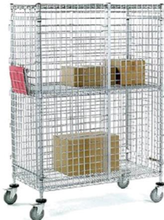
Security Units NEXEL STS2460C 60"W x 24"D x 69"H