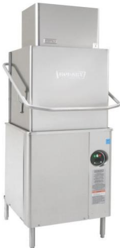
Commercial Dishwasher Hobart AM15VL