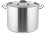
40 Quart Stock Pot