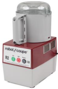
Food Processor Robot Coup R2N