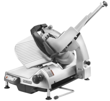
Deli Slicer Hobart HS7N-1