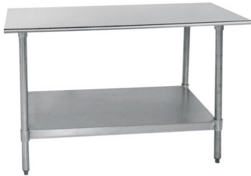
Station Table (30" x 72") Advance Tabco SS-306