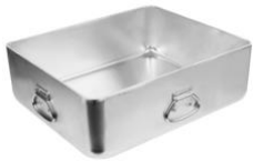
42 Qt. Roasting Pans