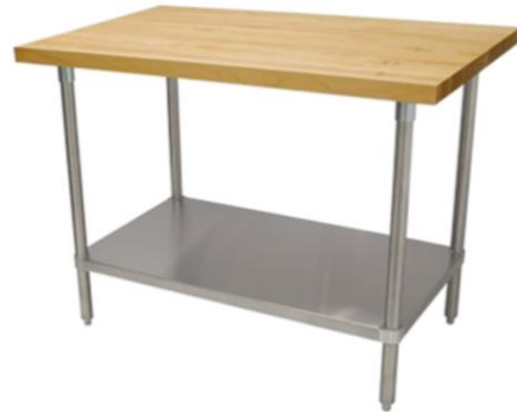
Wooden Table (30" x 72") Advance Tabco H2S-306