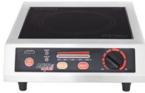
Induction Burners APW Wyott ICT-18A-120V