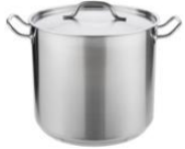
20 Quart Stock Pot