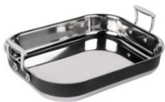
6 Qt. Roasting Pans